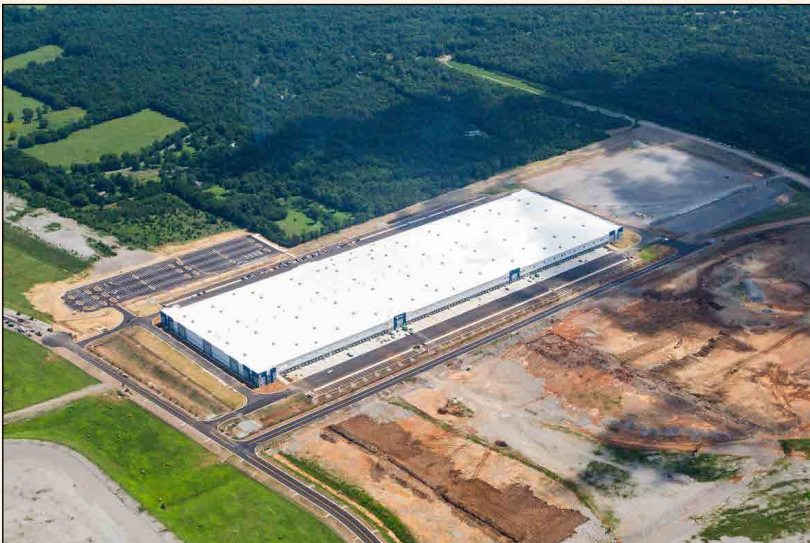
Building 1 - completed and leased. Photo: June 2019

Speedway Industrial Park presents an unmatched opportunity for users seeking a scalable, flexible and accessible site for bulk distribution, warehouse and light manufacturing facilities. The existing infrastructure, utilities and zoning supports accelerated construction schedules and speed-to-market potential.